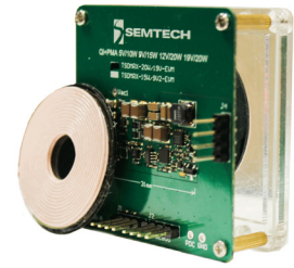
Semtech's LinkCharge™ 20 TSDMRX-19V20W-EVM reference design board

Applications: Robotics | Drones | Automation Systems Power Tools Medical Devices | Qi compatible | Low Profile / Compact | High Power