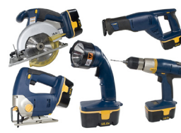
Power Tools Roamable Industrial Appliances