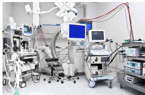
Hermetically Sealed Medical Equipment